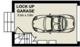
GARAGE GROUND FLOOR