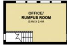
GARAGE FIRST FLOOR