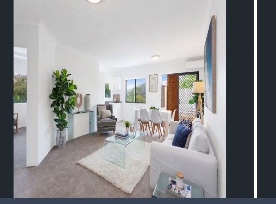
2/202-204 Gertrude Street North Gosford, NSW