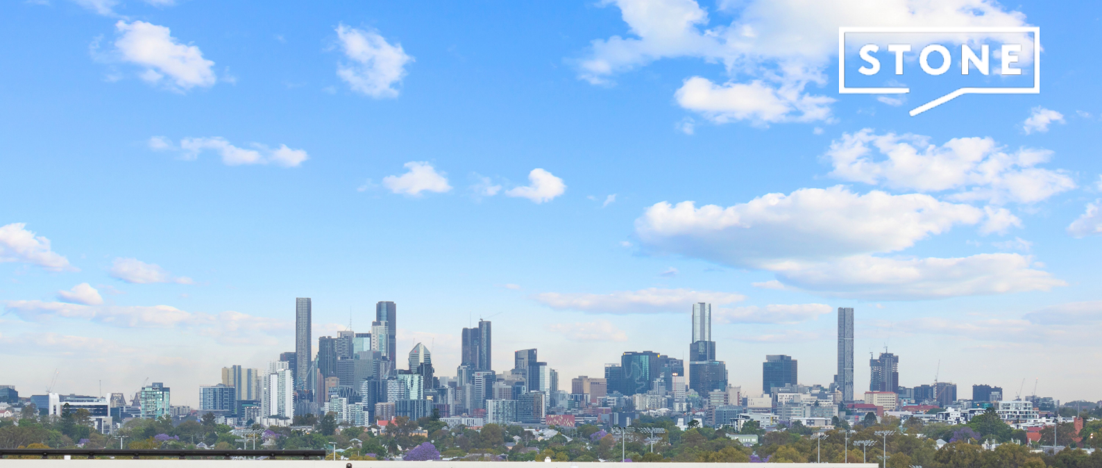
Photo taken from back deck.