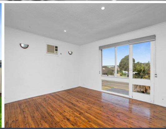
House & Granny Flat