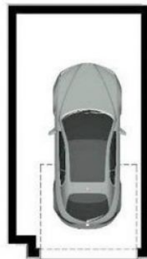
LOCK-UP GARAGE 3.1x5.8