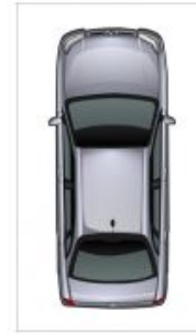
1 x CARSPACE 5.3m x 2.4m