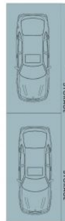
2 Car Space Basement