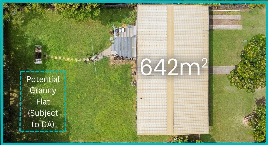
Plot outline and dimensions are approximate only