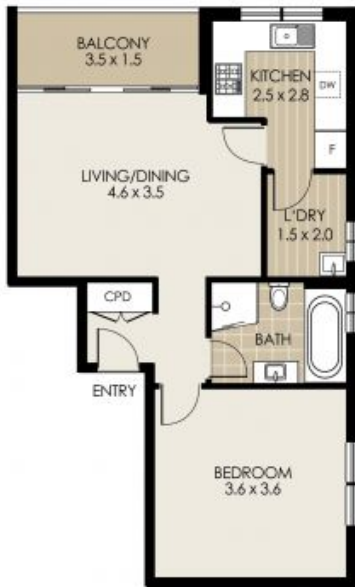
APARTMENT FLOOR PLAN