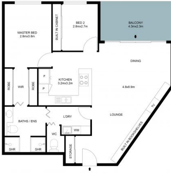
Floor Plan - Level 5