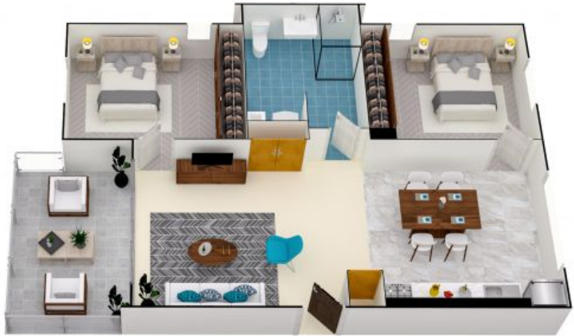
Unit Type Six