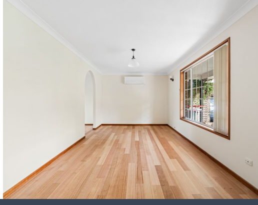
167 Lakedge Avenue Berkeley Vale, NSW