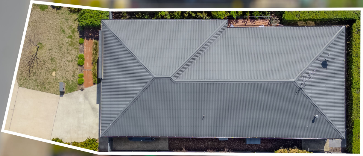
Approx. 405m 2