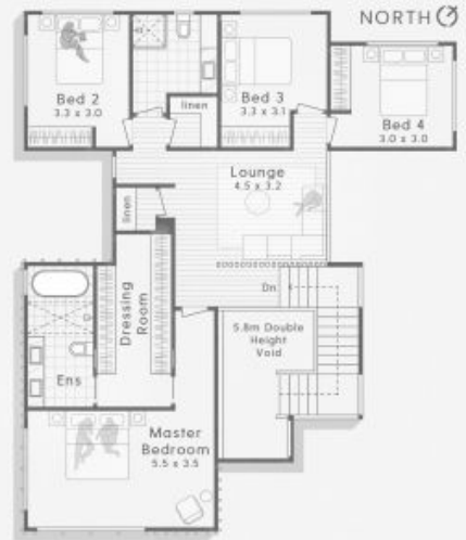
First Floor 2.7m Ceiling