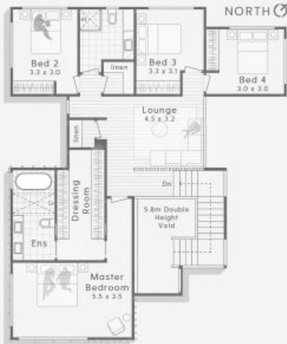
First Floor 2.7m Ceiling