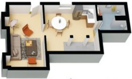
Ground Level/Teenage Retreat