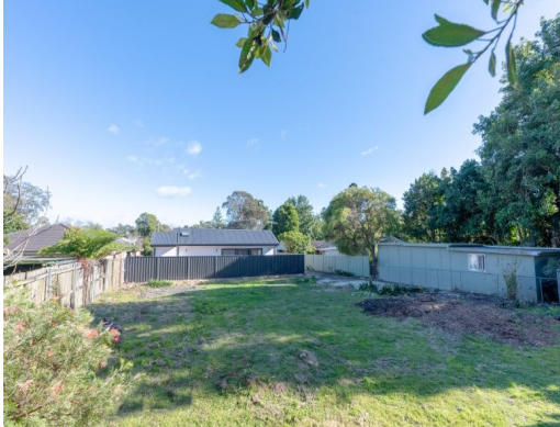
9A Leeming Street Mount Kuring-gai, NSW