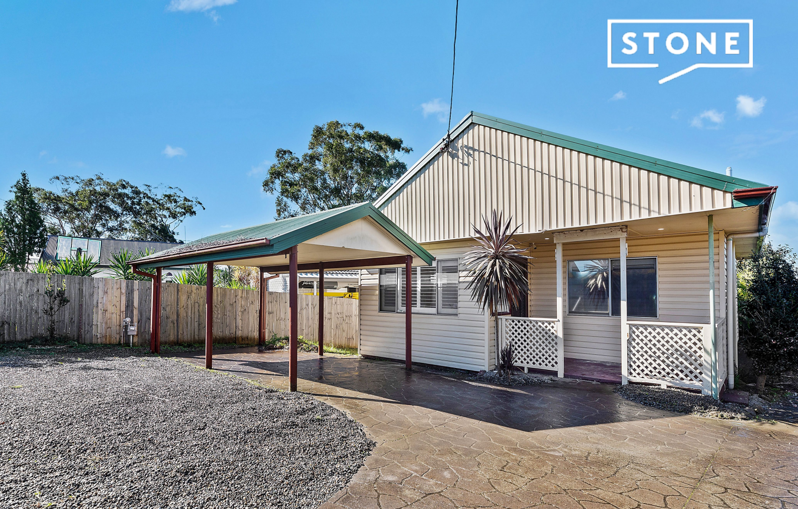
48 Tumbi Road, Tumbi Umbi