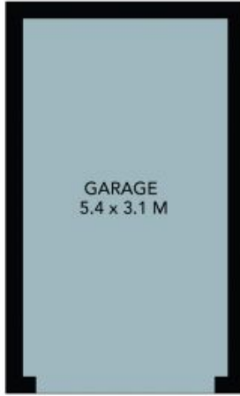
(NOT IN POSITION)