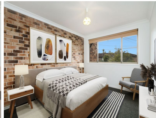
1a Highview Street Tumby Umbi, NSW 3 1 2