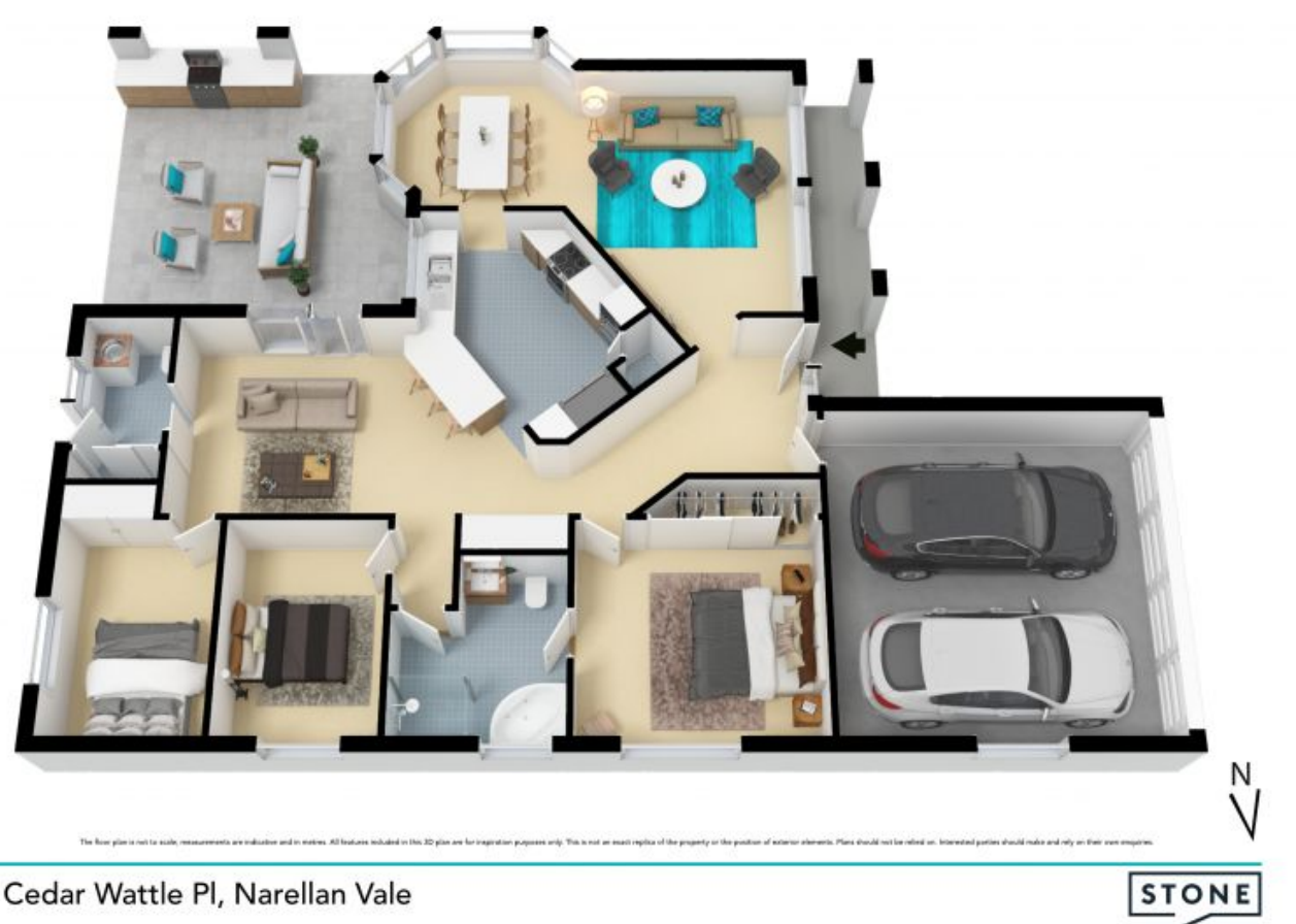
25 Cedar Wattle PI, Narellan Vale