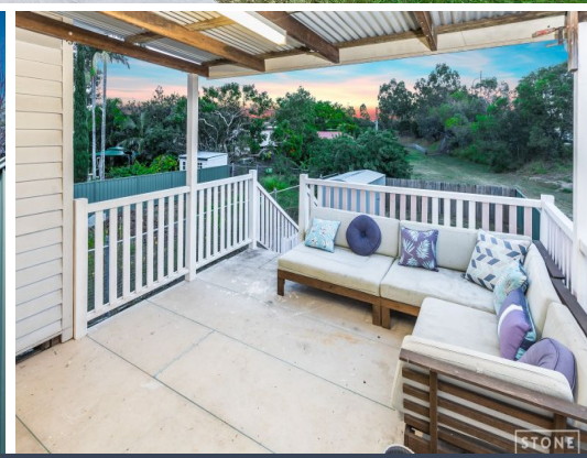
1 Dresden Street Bald Hills, QLD 3 1